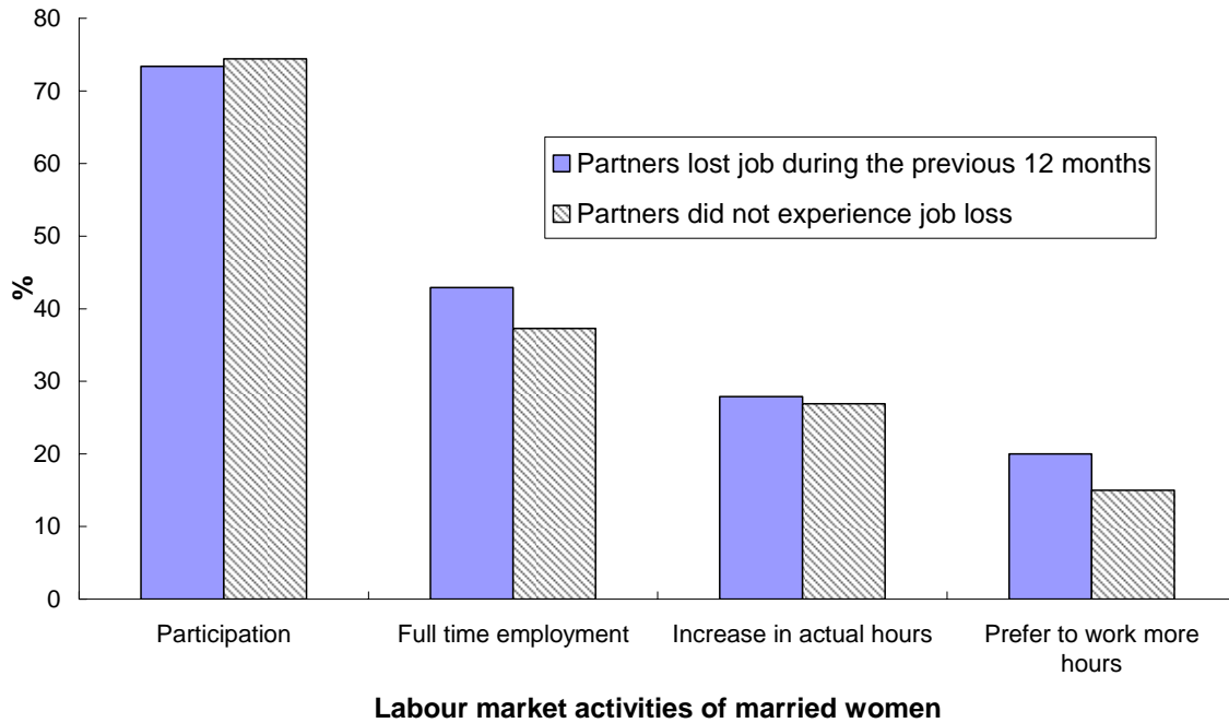
Figure 2. Females' labour market activities by partners' recent job loss experiences